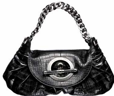
Every woman needs a great bag!

9) STYLISH HANDBAG – A simple and elegant handbag will spruce up the most basic of outfits and give it life and personality. Combining form and function, you can have both style and personality in a good stylish handbag - whether it is a leather tote bag or a designer label shoulder bag. Stick with a neutral color like black, brown, or taupe though. Your bag needn't match your shoes but you don't want it to clash with them either.