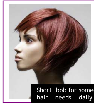
Short bob for someone with fine hair needs daily styling to achieve the same look

spotting a short bob hairstyle may need daily styling to achieve the same look.