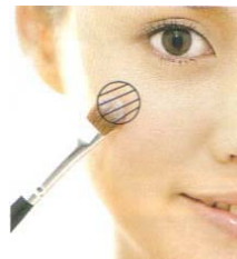
Smile and highlight the smiling muscles near your cheekbones

Step 5: Use highlight to create a 3-dimensional look by highlighting strategic positions on your face with shimmer powder to create an illusion of a smaller face.