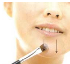
Use excess shimmer from the T-zone to highlight the chin for a sharper look