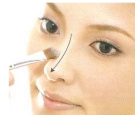
T-Zone: Brush downwards on the bridge of your nose