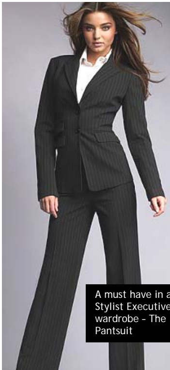
A must have in a Stylist Executive's wardrobe - The Pantsuit