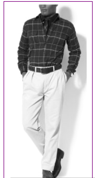
Business Casual for Men